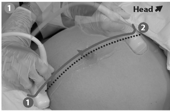
Transverse Center Pelvis Midline (Pelvic Bone to Breast Bone) Notch towards Patient's Right