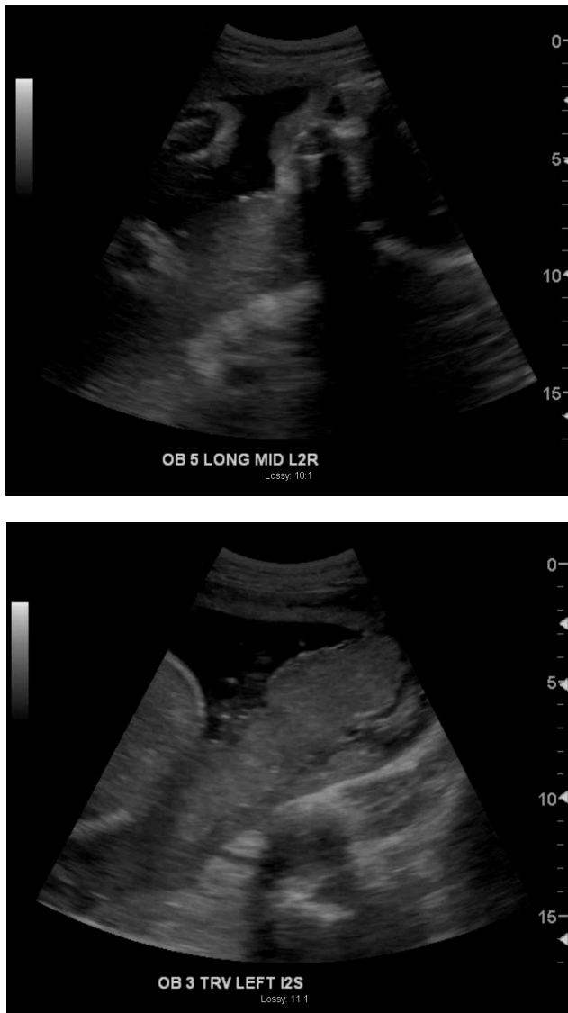
Figure 3. Representative images stored on the secure server. The images above are from a 2 nd trimester fetal presentation obtained at Nawanyago Health Center, showing the fetal head (top) and the placenta (bottom).