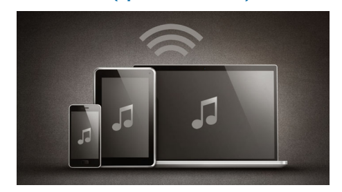
Bluetooth® (aptX® and AAC) for wireless music steaming