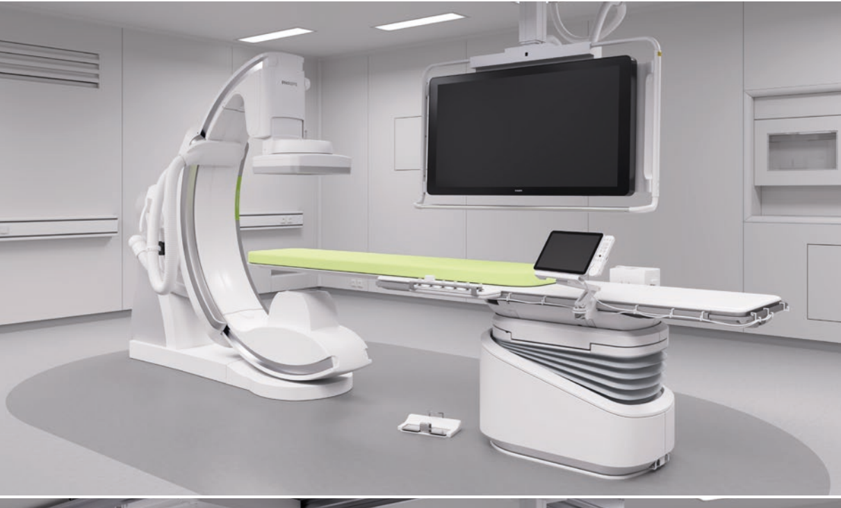
Azurion 5 F20