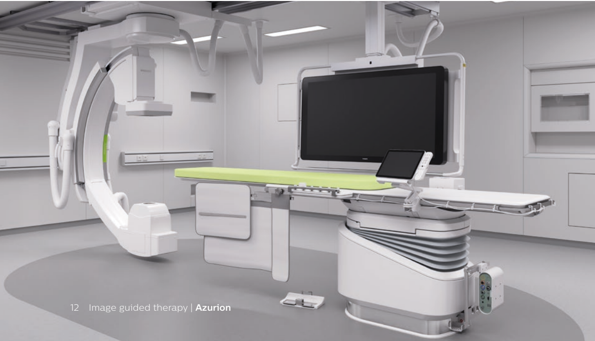
Azurion 5 C12