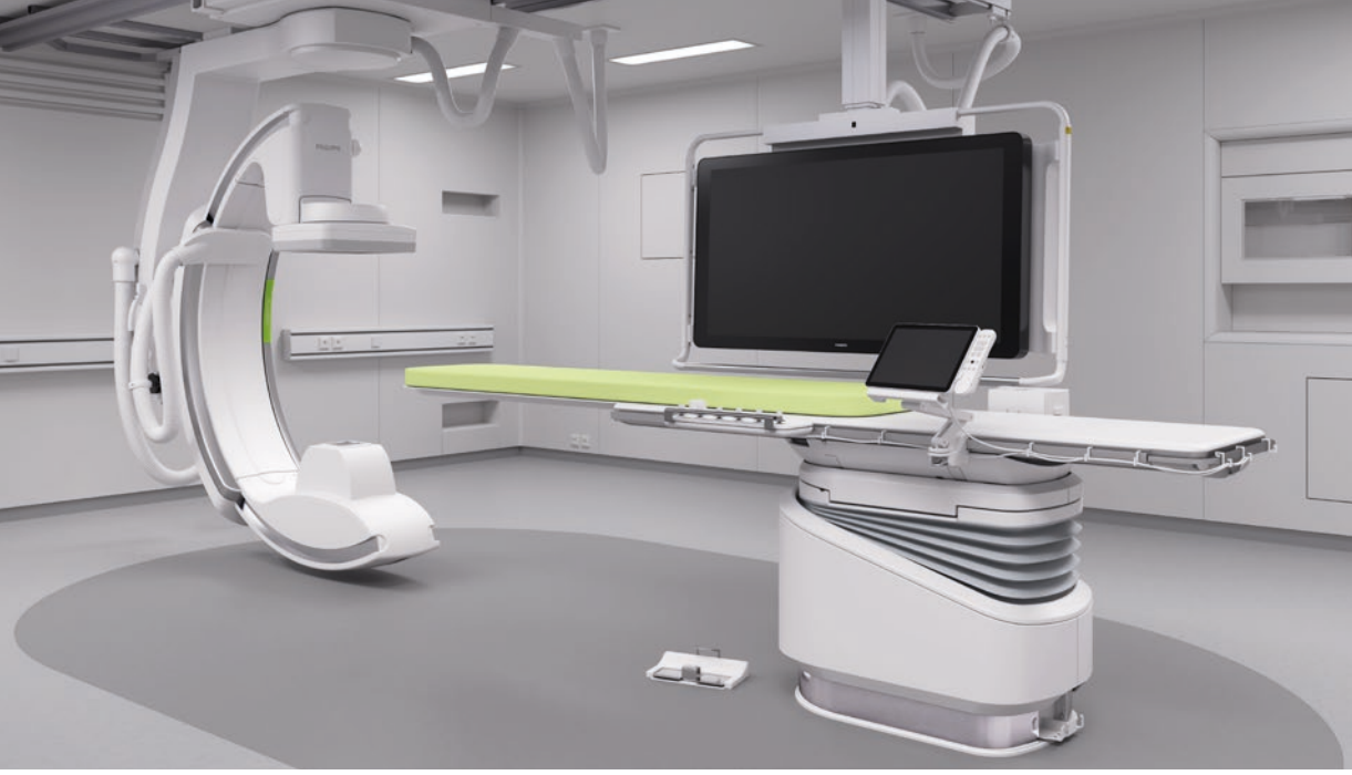
Azurion 5 C20