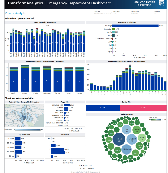
TransformAnalytics ED Performance Dashboard