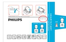
M5072A foil packaging