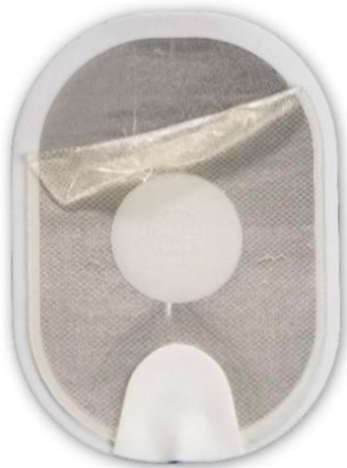
Figure 1: Separated gel that has folded onto itself when peeled.

It is also possible that the gel could separate almost completely from the foam/tin backing when peeled, (see Figure 3 .) Due to a small amount of gel surface contact area with the skin, electrical arcing could occur when a shock is delivered leading to burns to the patient's skin, or the AED could be unable to deliver any shock through the pads. A delay in therapy will result while the user installs a replacement pads cartridge (if available) or performs CPR while waiting for Emergency Medical Services Personnel to arrive. For comparison, Figure 4 shows a normal pad. No matter the state of the pad, follow the voice prompts because the AED will step you through the necessary actions.