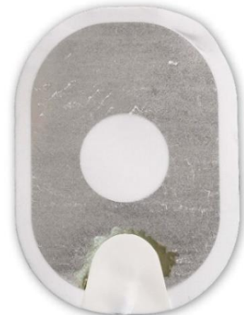
Figure 3: Gel almost completely separated from backing.

Action: Apply pads to the patient. Do not hesitate.