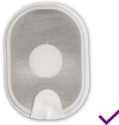
Figure 4: Normal pad.

Action: Apply pads to the patient according to the Instructions for Use/Owner's Manual.