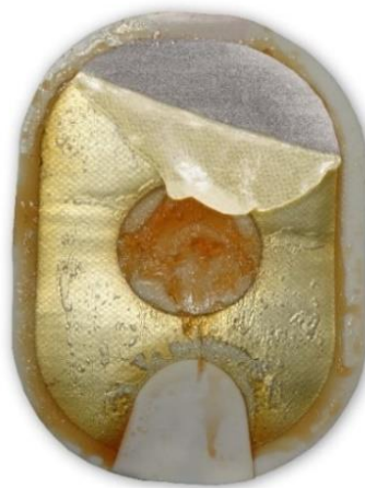
Figure 2: Separated, folded gel may also have a discolored and/or melted appearance.

Action: Apply pads to the patient. Do not hesitate.