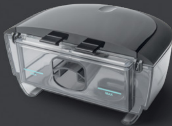
Water tank with lid