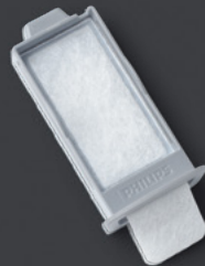
Reusable pollen filter