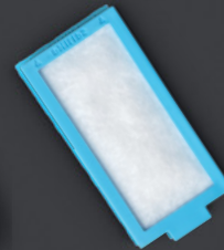
Ultrafine pollen filter