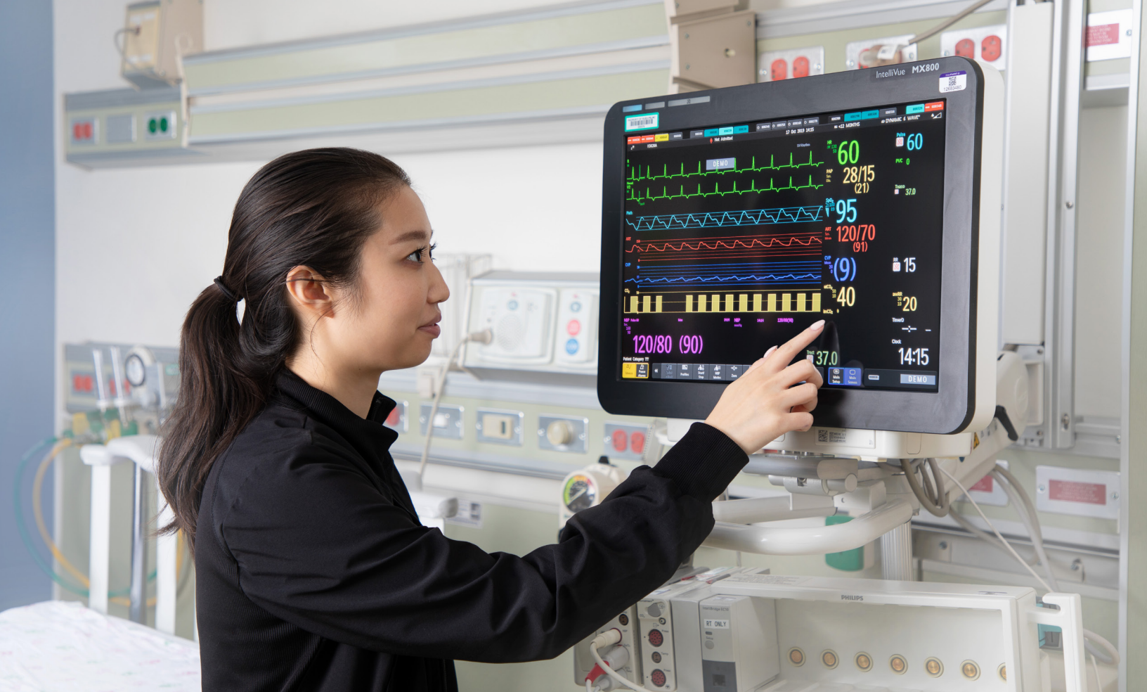
A nurse at Rush University Children’s Hospital Pediatric Intensive Care Unit uses the Philips IntelliVue MX800 bedside monitor to check on a patient.