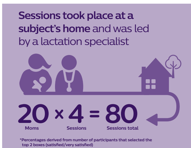
Figure 1 – Study design

In total, twenty Dutch mothers completed milk expression sessions in their homes, led by a lactation consultant. Mothers could not participate if they experienced any of the known side effects of breastfeeding / breast pump use (sore nipples, nipple trauma, bruising, engorgement, clogged mammary ducts, lactostasis, mastitis) at the time of the study. The majority of the subjects had an age between 31 and 40 years and were Caucasian. All were breastfeeding their baby since he/she was born and were experienced with using a breast pump.