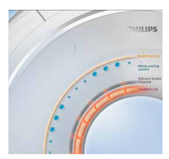
There is a negligible energy transfer from gradient coil to the magnet. This allows to maintain perfect B0 stability overtime which is especially beneficial for B0 sensitive acquisitions like cardiac bTFE sequences.

BlueSeal magnet would not be such a game-changer if it only revolutionized MR operations. In parallel, Philips placed a great deal of emphasis on creating a magnet design that delivers excellent clinical performance. Thanks to highly efficient cooling properties from its microcooling system, the BlueSeal magnet does not compromise in performance specifications for homogeneity, homogeneity stability over time, FOV, BO-stability over time. Furthermore, the magnet offers a leading homogeneous field-of-view of 55cm for a 1.5T 70cm system and a wealth of new clinical capabilities that help you answer the most challenging demands.