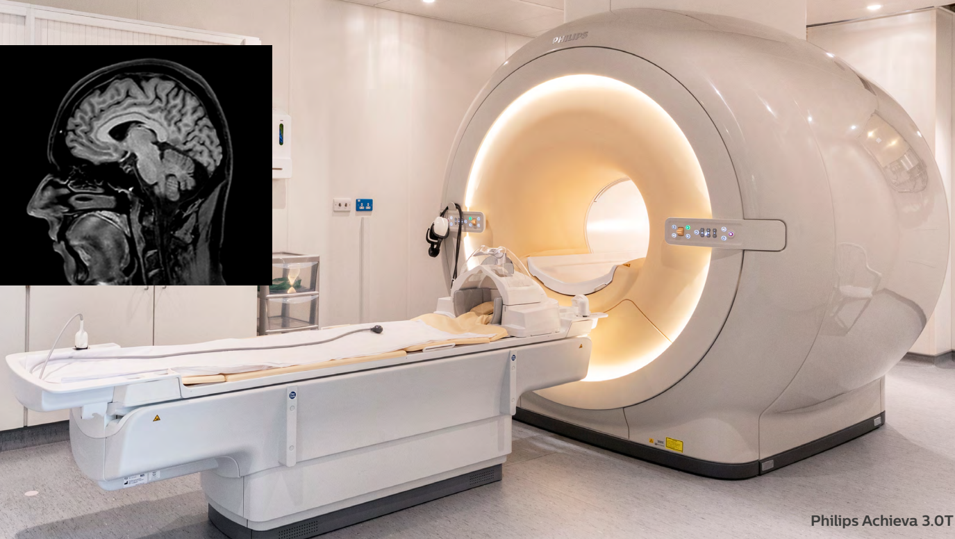
Philips Achieva 3.0T MRI