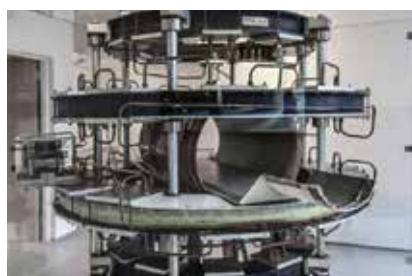
Mark 1 scanner

In 2001, in acknowledgement of the pre-eminence of the University of Aberdeen in the field of medical MRI for over thirty years, the University was recognized with 'The Award of the Queen's Anniversary Prize'. The citation stated that "during this time the Department of Biomedical Physics and Bioengineering has been responsible for a number of significant developments that have had a major impact on medical diagnostic imaging worldwide."