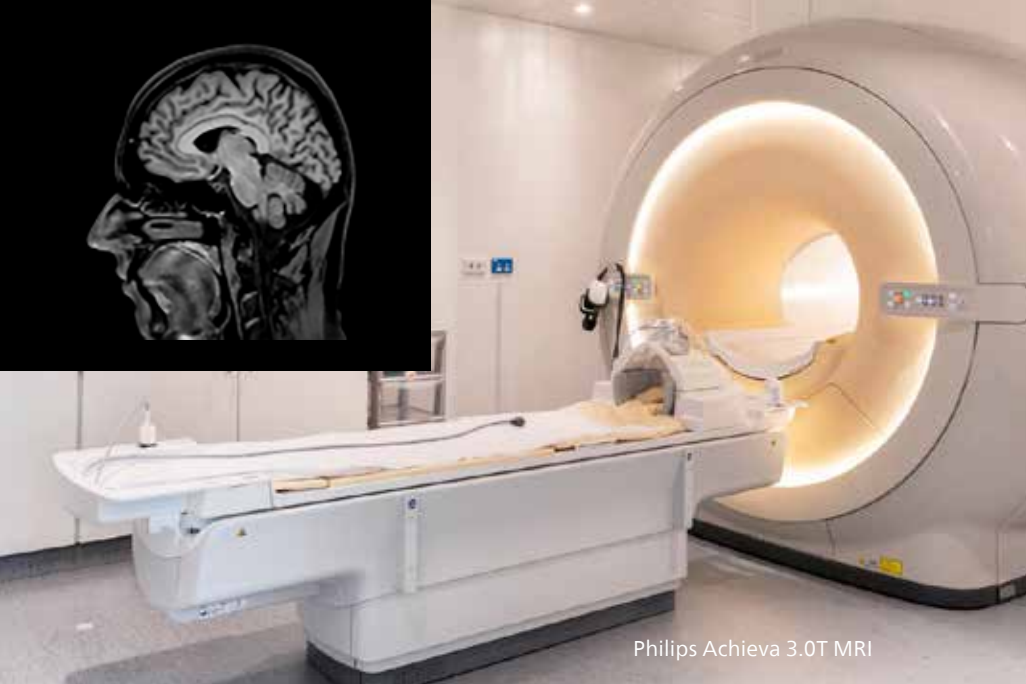
Philips Achieva 3.0T MRI

“ Our decision in 2007 to select the Philips scanner was based on three main themes: access to cutting edge technology; access to Philips’ clinical applications team and the excellent service support provided by Philips.”