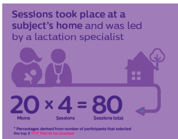
Figure 1 – Study design

In total, twenty Dutch mothers completed milk expression sessions in their homes, led by a lactation consultant. Mothers could not participate if they experienced any of the known side effects of breastfeeding / breast pump use (sore nipples, nipple trauma, bruising, engorgement, clogged mammary ducts, lactostasis, mastitis) at the time of the study. The majority of the subjects had an age between 31 and 40 years and were Caucasian. All were breastfeeding their baby since he/she was born and were experienced with using a breast pump.