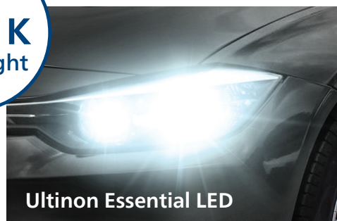
Ultinon Essential LED