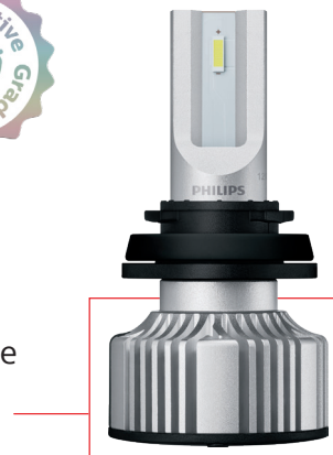
Integrated driver electronics in the bulb.

Important: LED headlights not for sale in the USA; sold in Canada only.