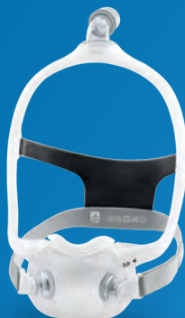
DreamWear Full face mask