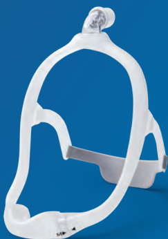
DreamWear Nasal mask