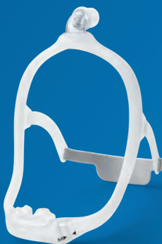
DreamWear Silicone pillows mask