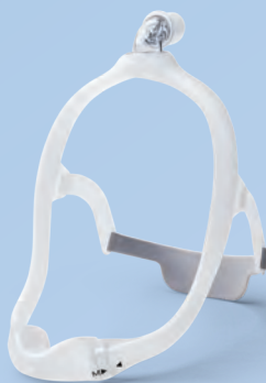
DreamWear Nasal mask

9 out of 10 users would recommend DreamWear silicone pillows to others with obstructive sleep apnea. 3