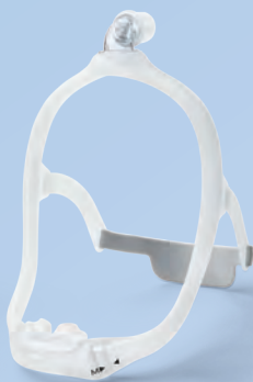
DreamWear Silicone pillows mask