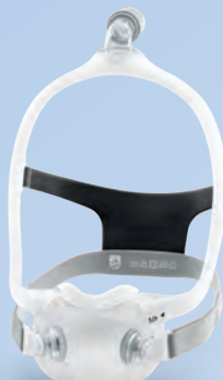
DreamWear Full face mask

Note: Switching from a nasal or silicone pillows cushion to a full face cushion requires different headgear and instructions. Consumers must consult their provider before making adjustments.