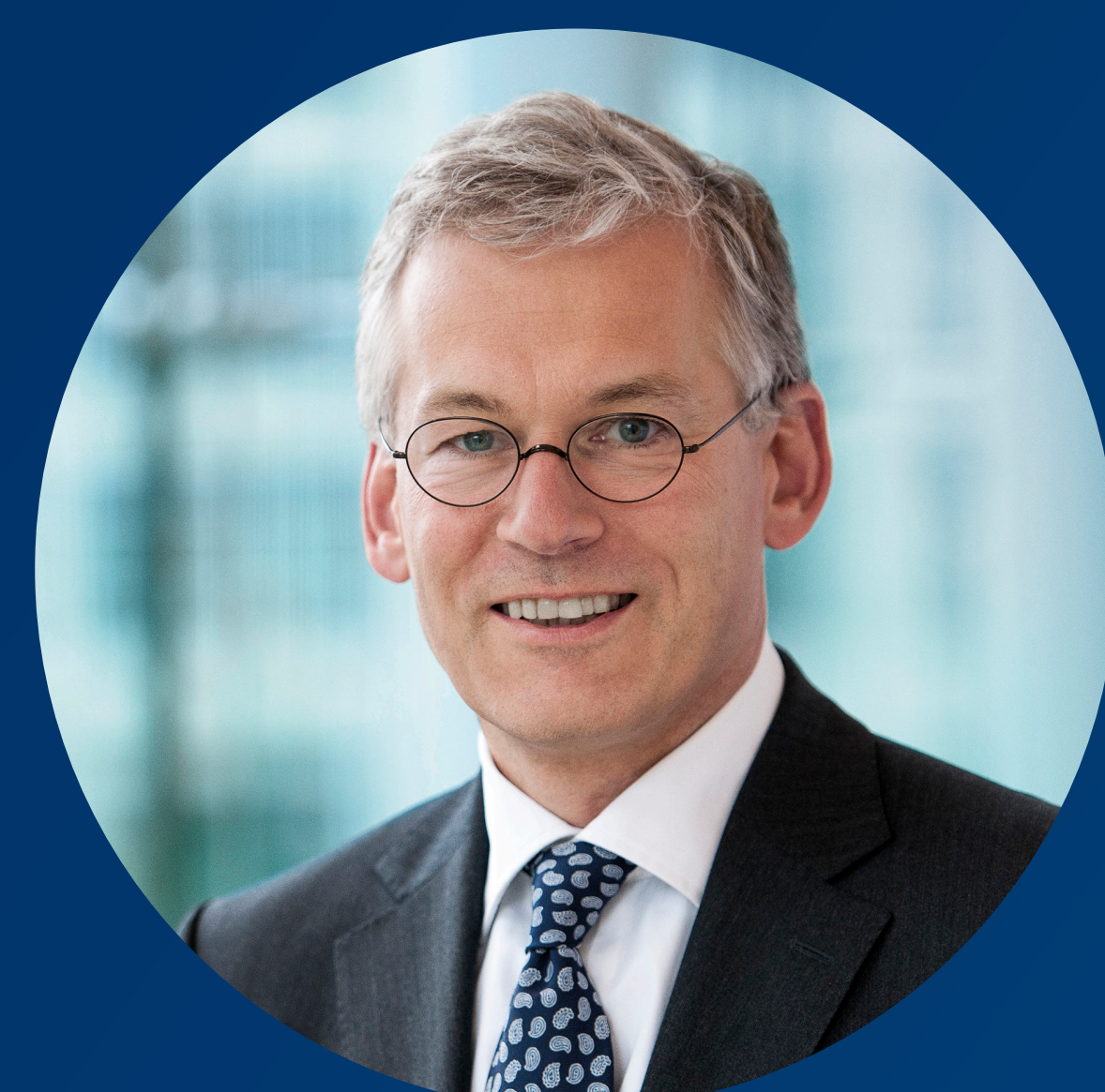
Frans van Houten, CEO Philips

“As a purpose-driven health technology company, we are very conscious of our responsibility towards society and of the need to continue to embed sustainability ever deeper in the way we do business – in our own operations and beyond, together with our partners.”