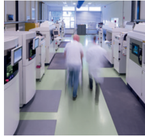
The factory in Best, geared for mass production of high-precision 3D-printed tungsten parts

Pure tungsten has a high melting point and is therefore often used for thermal or radiation shielding in the medical and nuclear energy industries.