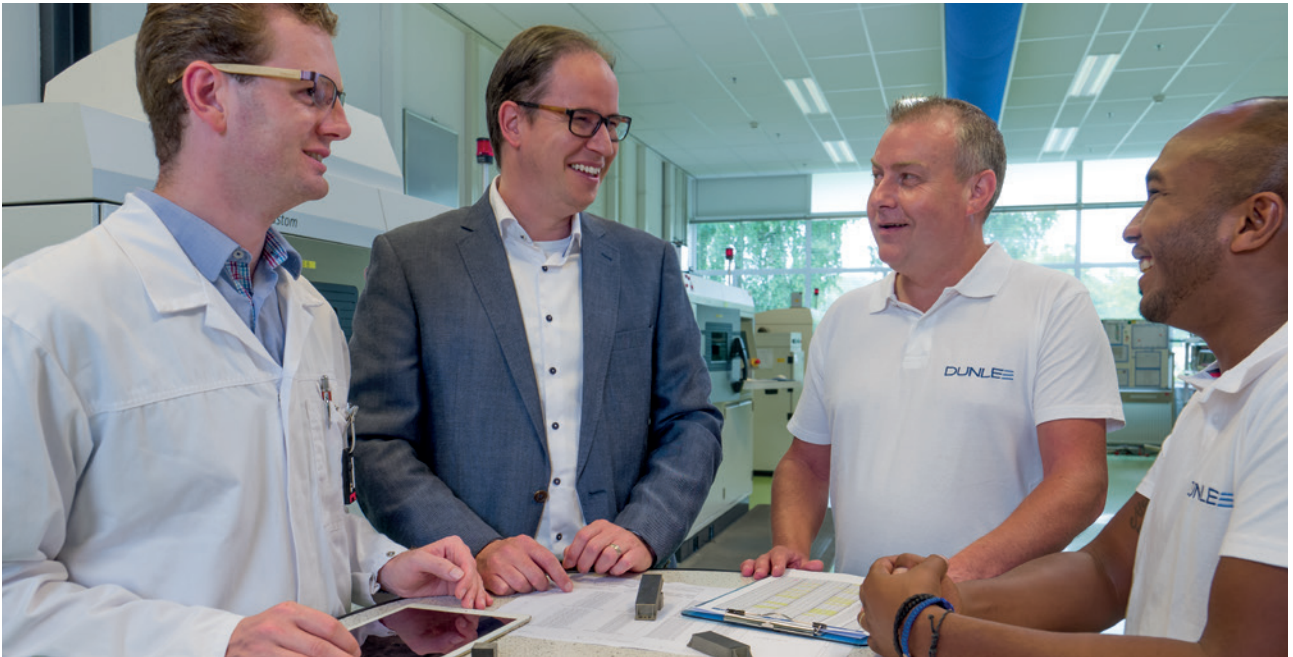
Team of industry experts to consult and partner with you on your projects

More than just a components manufacturer, Dunlee is a co-developer that works with you from component ideation through volume production. Powder bed laser melting technology provides freedom in design and allows us to build highly complex, pure tungsten parts on an industrial scale.